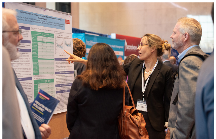
EXHIBIT BOOTH - $2,995

Don't see what you're looking for? Let us know! We want to work with you!