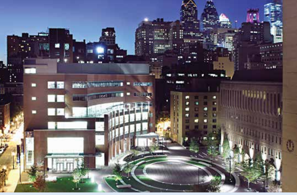
TUITION SCHOLARSHIP PROGRAM: The Colloquium is pleased to offer full and partial tuition scholarships to qualifying representatives of local, state and federal government, consumer advocate organizations, safety net providers, academics, students, and health services research organizations. Consult the web site for details.